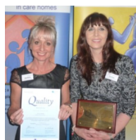
Oakfield Nursing Home with their award (left)