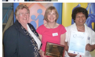
St Teresa's Home (left)