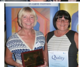
Danesford Grange (right)