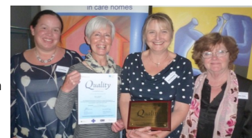
The Malthouse with their award (right)