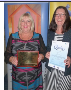
Some of the GSF Reaccredited care homes following presentation of the GSF Quality Hallmark Award September