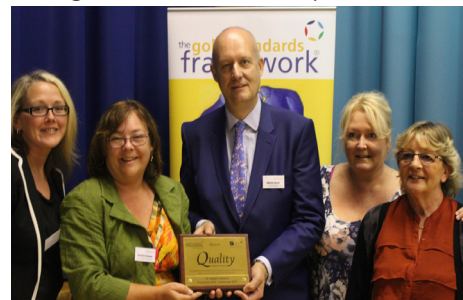
The first GSF Accredited Hospice - Jospice in Liverpool

CL Lifestyles, a home care agency in Somerset, received a certificate acknowledging its commitment to put all of its staff through the GSF Domiciliary Care Training Programme.