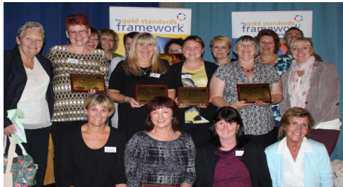
The first community hospitals to receive the accreditation GSF Quality Hallmark Award - 12 wards from Cornwall