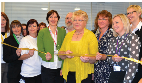
Launch of Gold Line in Airedale Hospital Trust to help support GSF patients to remain at home

Since 2013 the GSF Centre has been working with three Foundation sites as part of the GSF Cross-Boundary Care Programme (XBC). These Foundation sites include Airedale, Dorset and Nottingham and all have been using GSF Training Programmes in at least two or three settings – always including GSF in acute hospitals.