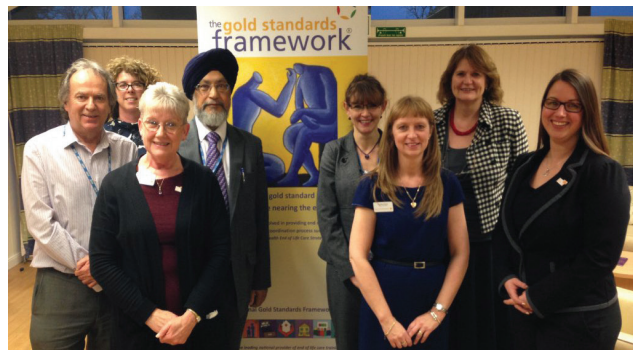
Havering CCG, GSF Team and St Francis meet for GSF Going for Gold event December 2013

April 2014: GSF Visit to China. Some of the GSF team have been asked to run a conference on end of life care in Beijing. China's one-child policy and their ageing population of the 1.2 billion people has created great challenges in end of life care. The GSF team have been asked to bring their expertise in improving population based end of life care