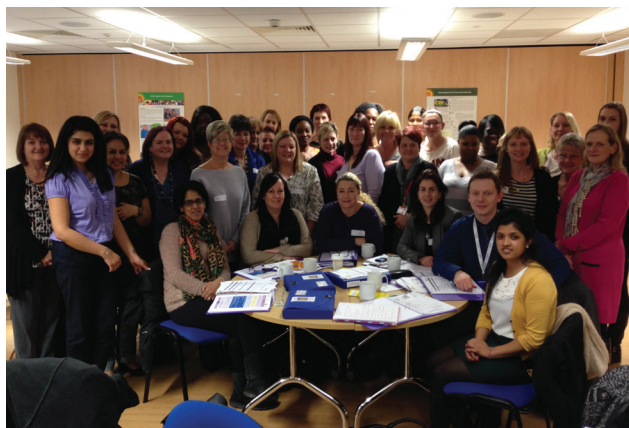
Saint Francis Hospice Romford hosts GSF Domiciliary Care Training Programme